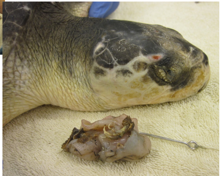
Successful hook and bait removal!